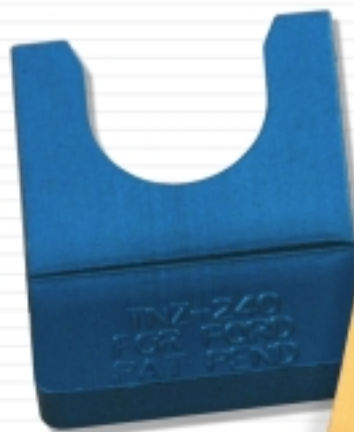
PMITNZ240 Ford Hose Tool