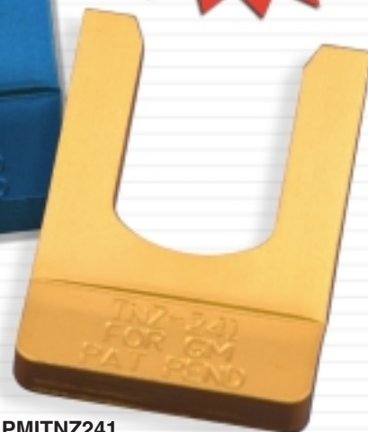
PMITNZ241 G.M. Hose Tool